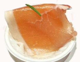
Persimmon and Prosciutto