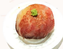
Roast Beef Temari Sushi