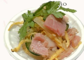
Ham "Aemono" Salad