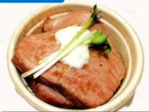
Roast Beef Over Rice