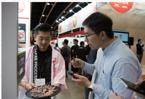
Product tasting session