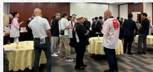
View from the networking event

On August 13 (Wed), the day before the exhibition, starting at 7:00 PM, a pre-exhibition networking event was held at the Hong Kong Japanese Club, inviting local buyers and others. Twenty-four companies and 41 buyers, carefully selected by local partner companies knowledgeable in food distribution, participated. They freely sampled the products displayed by each company, and participated in active business discussions and exchange of information in a relaxed atmosphere.