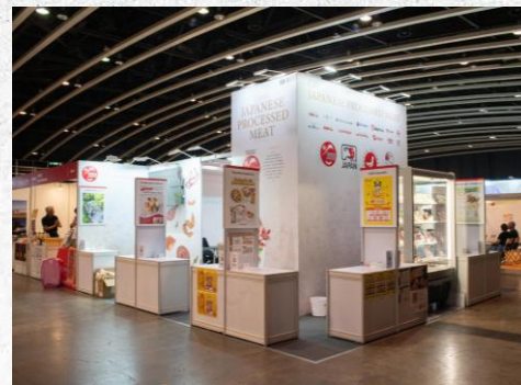
View of the booth atmosphere

Further, among the survey respondents, over half (approximately 53%) of industry professionals reported that they currently handle Japanese processed products. The reasons cited were notably for their "deliciousness (69.8%)" and "safety (58.7%)." This indicates a high level of trust in Japanese processed meat products among Hong Kong consumers.