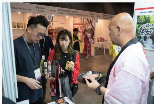
Networking was a success