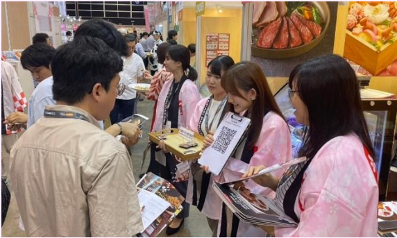
Surveys being conducted