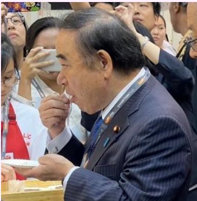
Tetsushi Sakamoto, Minister of Agriculture, Forestry and Fisheries

After participating in the Japan Pavilion opening ceremony as the representative of the Japanese government, Tetsushi Sakamoto, Minister of Agriculture, Forestry and Fisheries, also visited the All Japan booth.