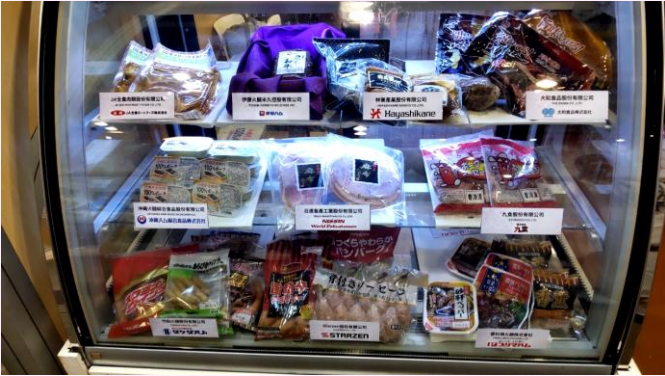
Exhibited products (from 10 companies)

At the booth, supported by PR staff from participating companies and the secretariat, we distributed pamphlets and brochures to convey the appeal and characteristics of Japanese processed meat products. We also offered daily tastings of products from the 10 cooperating companies. Nearly 200 people responded to the tasting survey, with over 70% claiming they were "very satisfied" or "satisfied" with the experience. Further, in a survey about impressions of Japanese processed meat products, over 80% of respondents cited "high quality," "attractive appearance" and "safe and reliable." This demonstrates a high level of trust in Japanese processed meat products within Hong Kong.