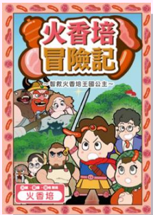
Distributed brochures (Traditional Chinese versions)