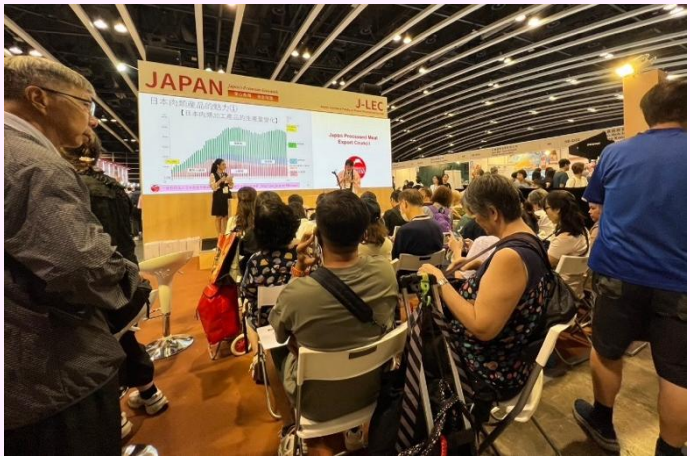
View of a seminar in progress

At a booth co-hosted by the Japan Livestock Products Export Promotion Council, seminars were held daily to highlight the appeal of Japanese processed meat products. The booth highlighted the safety and security of Japanese meat products, covering topics ranging from the relationship between Japanese food culture (such as bento boxes and ramen, which are gaining popularity overseas) and meat products, to HACCP initiatives. After each seminar, sample tastings were provided on daily rotation (3 products per day x 3 days), receiving many comments such as "delicious" and "where can I buy this?"