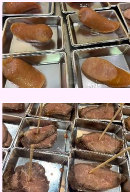
Tasting menu samples