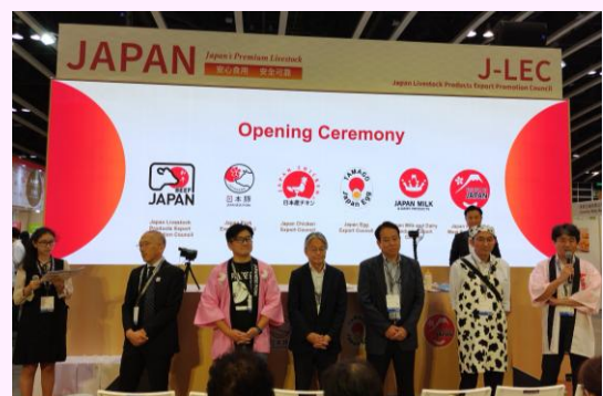
Six representatives from the committee gave greetings

Established on February 1, 2021, the Processed Meat Export Committee has, since its inception, followed the lead of other established committees for different product categories. This includes undertaking activities such as creating and trademarking a unified logo mark and producing promotional pamphlets. Since 2023, the committee has been exhibiting at overseas trade shows, advancing plans for full-scale activities aimed at developing export markets and expanding exports. Hong Kong Food Expo PRO 2024 marked our fourth overseas exhibition. With many exhibitors and visitors, our booth was also a great success.