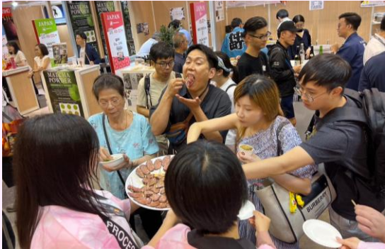
View of the exhibition booth