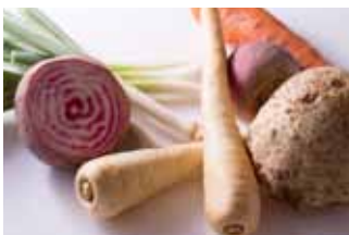
Les Saisons uses abundant seasonal vegetables from all over Japan, including choggia beets, parsnip, leeks and the like. Raw or roasted, they deliver a deep flavor.

Japan’s cuisine culture is winning attention all over the world now and many people are aware of the quality ingredient called Japanese wagyu. Assuming that sirloin and fillet will continue to be exported, Japanese should also include shank, cheek, oxtail and other cuts in the menu if they wish to strongly convey the unique appeal of Japanese wagyu to French customers.”