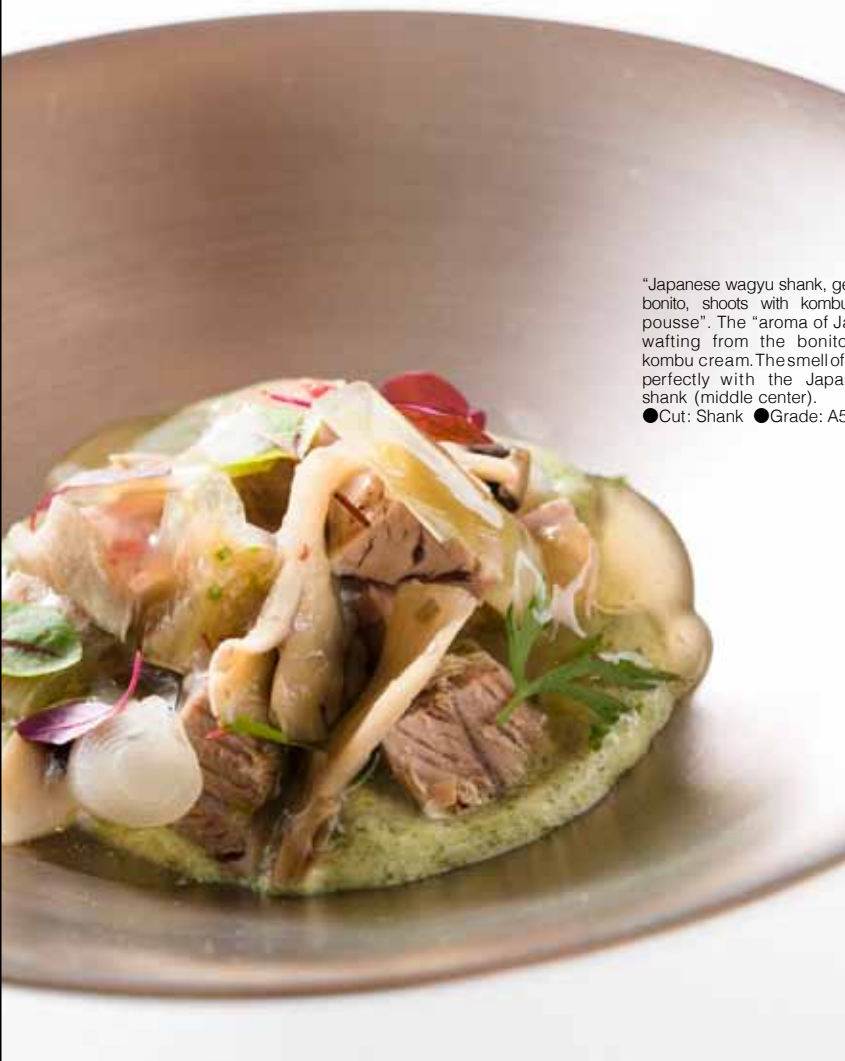
“Japanese wagyu shank, gelée with dried bonito, shoots with kombu cream and pousse”. The “aroma of Japan” comes wafting from the bonito gelée and kombu cream. The smell of the sea pairs perfectly with the Japanese wagyu shank (middle center). ●Cut: Shank ●Grade: A5