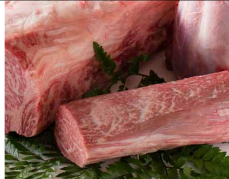
Wagyu fillet (front) and sirloin (back left) are perfect for a simple roast to highlight the meat's quality. If you cook it just right so as to draw out the Japanese wagyu's sweet fat and fleshiness, just a small garnish and sauce as an accent is plenty.

"Simmered Japanese wagyu cheek and beef fillet, quenelle de moelle truffe potato soufflé", based on classic French cuisine called "Ripoppé", combines Japanese wagyu cheek and fillet in a recipe that is truly deep and sublime. It's flavored with truffle and finished in a red wine sauce. ●Cut: Cheek, Fillet ●Grade: A5